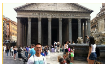
2013 Summer Abroad in Rome, Italy.

Louisiana, outside of the U.S. That's one part of the Real World that International Studies students may end up in after