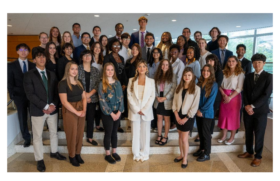
2023 Summer Undergraduate Research