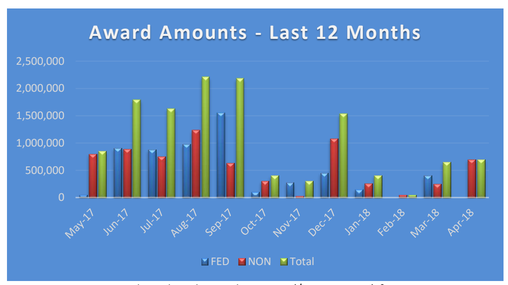
NOTE: Removed Medicaid award amount ($26,882,016) from June 2017