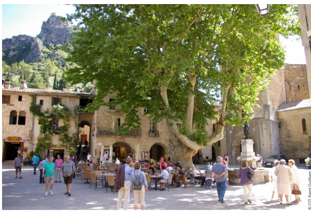
Main Village Square

4 km from the city center, this is a great place to swim or to visit just bask in the sun.