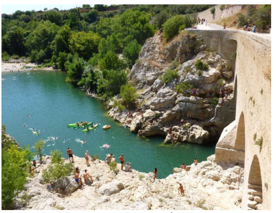
Pont du Diable

Saint-Guilhem-le-Désert has been counted among the Plus Beaux Villages (most beautiful villages) of France since 1999. It is home to numerous artists, many of whom may be found in their studios around the square. Take time to explore the town's main square or visit the nearby Pont du Diable for an amazing day a bit off the beaten path.