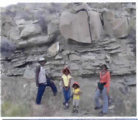
Ganis are posing in front of Cretaceous shelfal storm deposits (hummocky cross stratification), Book Cliffs, Utah.

To learn more about my academic activities, you can visit my webpage: <u>http://ees.uno.edu/Gani_Royhan/</u>